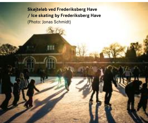
Skøjteløb ved Frederiksberg Have / Ice skating by Frederiksberg Have

Vi guider dig her til vores top 5 julebegivenheder i København.