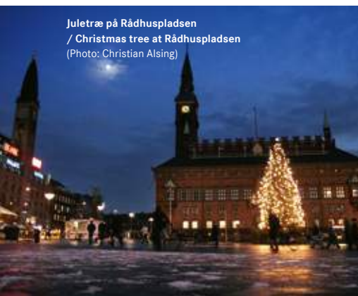
Juletræ på Rådhuspladsen / Christmas tree at Rådhuspladsen

København osrer af hygge og god stemning i julemånederne. Byens museer inviterer til julearrangementer, og byens gader er alle julepyntet på smukkeste vis. Jul i Tivoli er et must, men prøv også byens hyggelige julemarkeder og andre traditioner som tænding af juletræet på Rådhuspladsen og skøjtebanen på Frederiksberg.