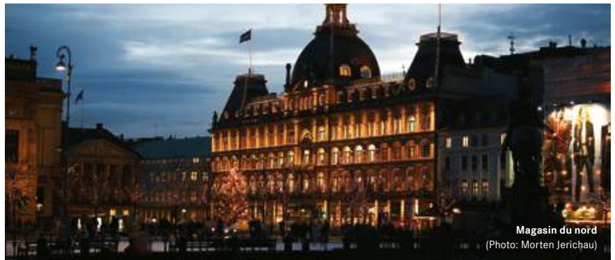
Magasin du nord

Christmastide in Tivoli Gardens is full of traditions for you to enjoy – the Tivoli Pixie Band, which performs at various sites in the gardens, the Gingerbread Palace that is Tivoli Gardens' very special gingerbread workshop, the Christmas light show in the Chinese area of the gardens with 16,000 sparkling, starry lights and, on December 13 th , the Lucia procession.