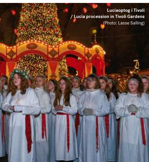
Luciaoptog i Tivoli / Lucia procession in Tivoli Gardens

Christmas in the Tivoli Gardens is synonymous with Christmastide in Copenhagen. As tradition dictates, there are beautiful decorations and lights that sparkle throughout the gardens. The sparkling lights, the booths exuding aromas of Christmas and the sound of Christmas tunes create Tivoli Gardens' very own Christmas atmosphere.