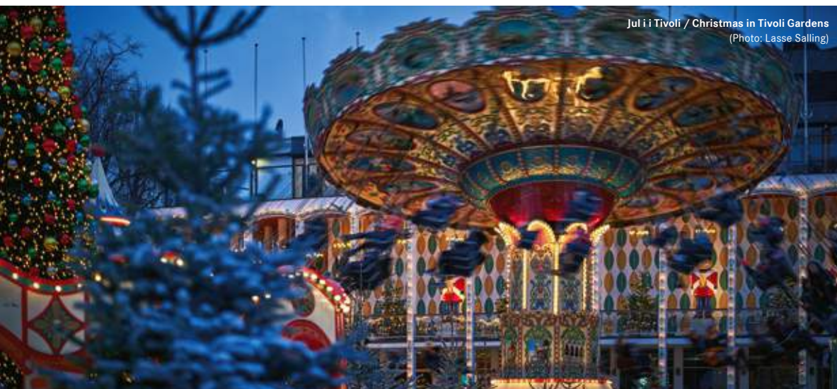
Jul i Tivoli / Christmas in Tivoli Gardens