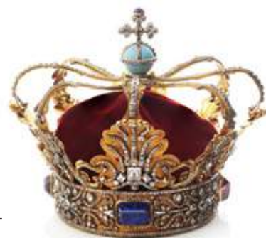
Kronjuvelerne på Rosenborg Slot / The Crown Jewels at Rosenborg Castle

I Skatkammeret på Rosenborg Slot er de to kongekroner og dronningekronen opbevaret i underjordiske kamre med metertykke mure sammen med kronjuvelerne. Kronerne er overdådigt