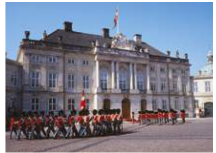
Amalienborg Slot

The Little Mermaid – one of Denmark's most famous and popular attractions from 1913 – is located at Langelinie and depicts the character from Hans Christian Andersen's fairytale of the same name.