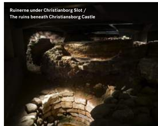
Ruinerne under Christianborg Slot / The ruins beneath Christiansborg Castle

– Denmark's mythological protector – who has stood watch over the nation in the cold casemates for several centuries. The saga maintains that, if foreign enemies threaten the country, the statue transforms to a warrior of flesh and blood and Holger Danske will again ensure the safety of the nation!