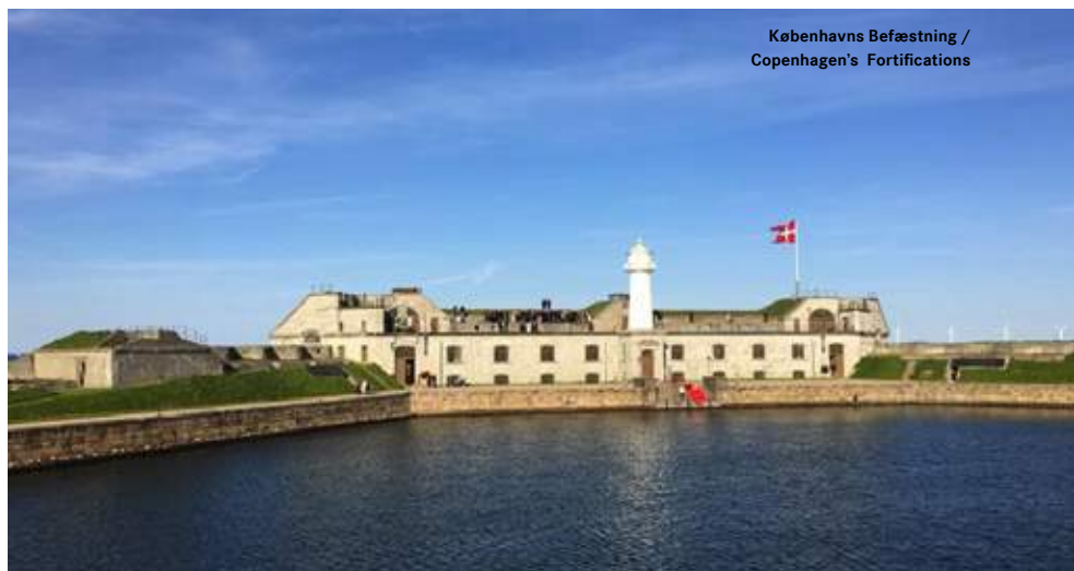
Københavns Befæstning / Copenhagen's Fortifications