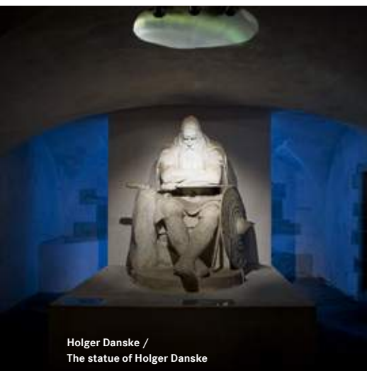
Holger Danske / The statue of Holger Danske

For at komme til slottet kan du tage toget til Helsingør, som går fra Østerport station - ca. 20 minutters gang fra Admiral Hotel.