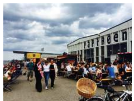
Papirøen, Paper Island