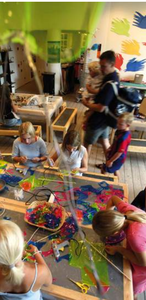
Børneværksted, Children's workshops

Jazzfestival, legepladser, børneværksteder og eventyrlig forlystelsespark. København har masser af sjove oplevelser og attraktioner for børn. Uanset om du vælger at tage offentlig transport, udforske byen på to hjul eller på gåben, er byen et sandt børnemekka. Her er vores guide til København i børnehøjde.