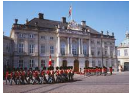
Amalienborg Slot

The Little Mermaid – one of Denmark's most famous and popular attractions from 1913 – is located at Langelinie and depicts the character from Hans Christian Andersen's fairytale of the same name.