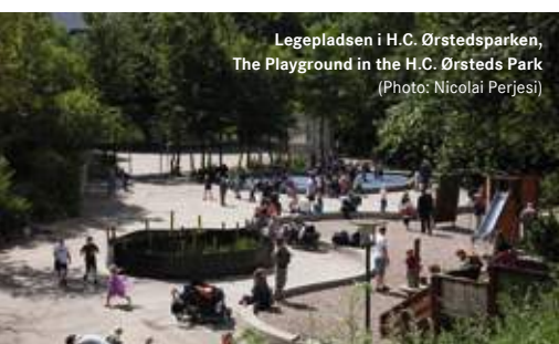
Legepladsen i H.C. Ørstedsparken, The Playground in the H.C. Ørsted's Park

As you can see, there is lots of fun available in Copenhagen for all of the family!