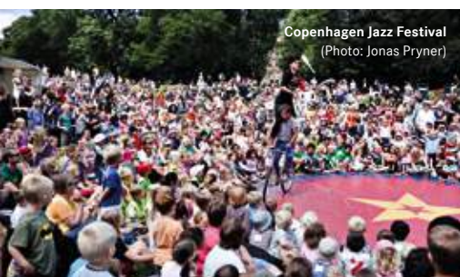
Copenhagen Jazz Festival