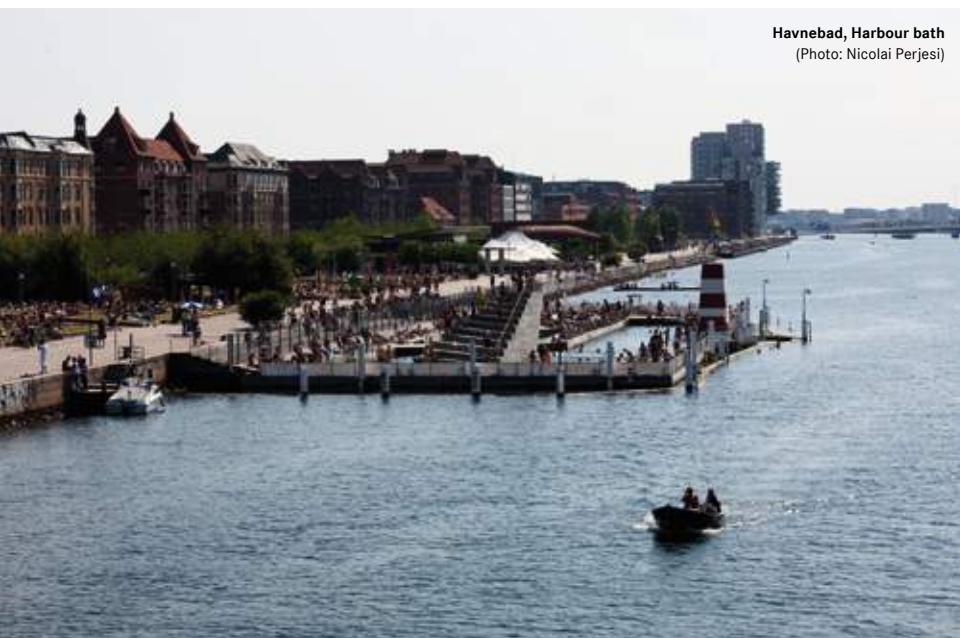
Havnebad, Harbour bath

Også Zoologisk Have byder på ekstra mange oplevelser i løbet af sommeren. Oplev elefanternes daglige brusebad og sommerstemningen på savannen. I Zoolab kan børn i alle aldre lære mere om dyr.