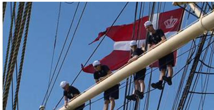
Elever i riggen tager sig af sejlene i DVD'en om Skoleskibet Danmark, Apprentice sailors clamber the rigging when managing the sails. See the DVD about The Training Ship "Danmark"

Ud over DVD'en, får du også et 12 siders hæfte om skoleskibets historie. Kan købes i receptionen til kr. 149.